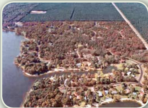
In many localities, good fire prevention requires cooperation among neighbors.

Residential developments within the wildland-urban interface often include a higher density of housing than typically found in more rural areas. In these cases, an individual's Home Ignition Zone might overlap that of a neighbor's. In these developments, if one property owner does everything possible to improve the condition of their property and the