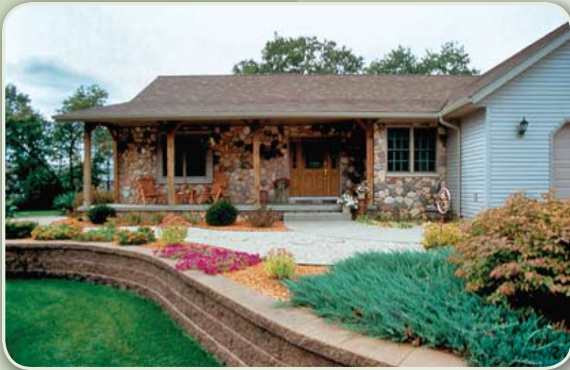
This raised garden bed is an attractive, low-maintenance, and fire-resistant landscaping choice.