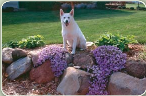
Rock walls are another creative, FireSmart landscaping choice.