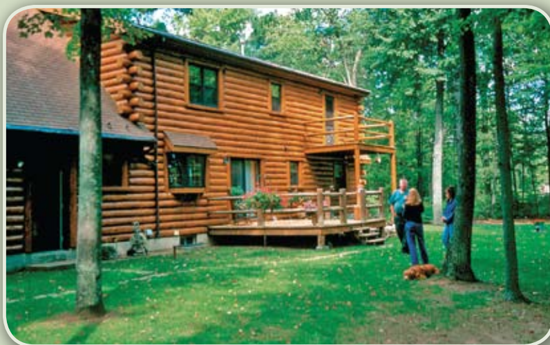
A well-managed Home Ignition Zone helps keep wildfire away.

Crown fires can catapult burning embers onto your property, including your home. Crown fires are the most destructive of all wildfires, able to kill mature trees and shrubs, and can move over large areas in short periods of time. Some surface fires, especially grass or marsh fires, can move very fast and cause great injury or even death when they are underestimated. Surface fires can become crown fires in stands where there are "ladder fuels" (i.e. branches that extend to the ground and allow a fire to climb up a tree to its crown).