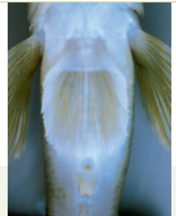
Fused pelvic fins act as a suction cup for the round goby.