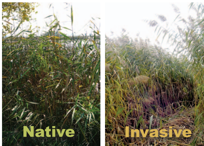
Figure 1: A native Phragmites stand (left) and an invasive Phragmites stand (right). Note the varied vegetation and lower density of native Phragmites stalks on the left and the taller, higher density invasive Phragmites stalks on the right.

Invasive Phragmites reproduces by dispersing seeds, by roots via rhizomes, or by stolon fragments. Dispersal can be natural through water, air, or animal movement, as well as through human actions and equipment such as horticultural trade, boats, trailers, or ATVs. Invasive Phragmites rhizomes can grow horizontally several metres per year and this is the most common method of reproduction. Vertical plant growth can reach 4 cm per day and plants can produce thousands of seeds annually.