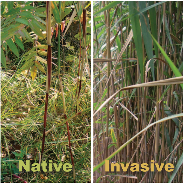
Figure 2: A native Phragmites stem (left) and an invasive Phragmites stem (right). Note the reddish brown native stem on the left, and the tan/beige invasive stem on the right.

Native stand photo courtesy of Erin Sanders, MNR. Invasive stand photo courtesy of Janice Gilbert, MNR.