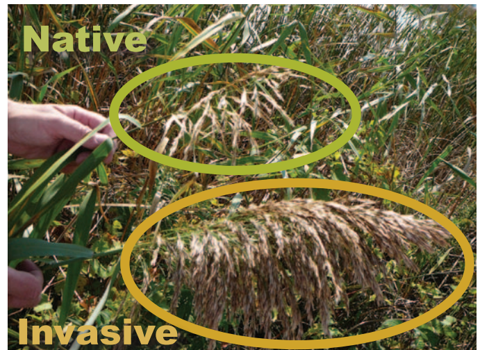
Figure 4: A native Phragmites seedhead (top) and an invasive Phragmites seedhead (bottom). Note that the native Phragmites seedhead is smaller and sparser compared to that of the invasive Phragmites .

Invasive Phragmites stems are generally tan or beige in colour with blue-green leaves and large, dense seedheads, in contrast to the reddish-brown stems, yellow-green leaves, and smaller, sparser seedheads of native Phragmites (Figure 2, 3, and 4). Cross-breeding between invasive and native Phragmites plants has not been confirmed in the field, but has been produced in laboratory studies. Where the plant is found in certain environmental conditions such as those that occur along sandy coastal shorelines and deep water systems, the morphological differences described above are not definitive. If it is not clear whether a Phragmites plant is invasive or native, it is recommended that a Phragmites expert be consulted.